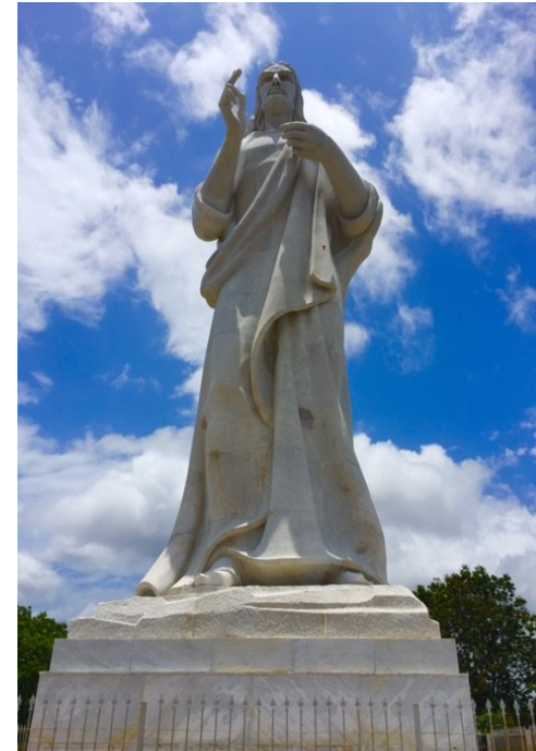
"Shoe the Children Without Shoes on Their Feet"