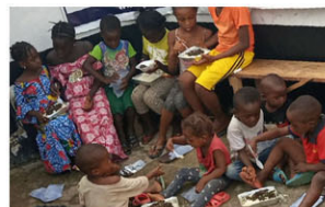
Christmas Day meal at Project KIKS sponsored orphanage, Monrovia, Liberia.

Numbers 6:24-26 24 The Lord bless you and keep you; 25 The Lord make his face shine upon you and be gracious to you, 26 The Lord turn his face towards you and give you peace.